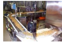
Allow products to move on conveyors without sticking