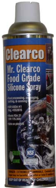
13 oz. net wt. (20 oz. can size)

NSF H1 Registered Food Grade Silicone Lubricant...meets FDA 21 CFR specifications for incidental food contact